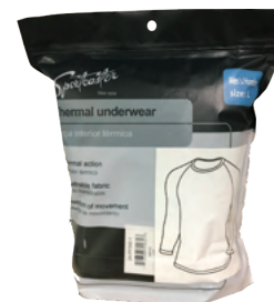
THERMAL BOTTOM PF-590-F