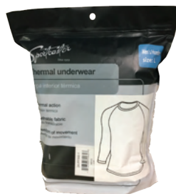
THERMAL TOP PF-592-F