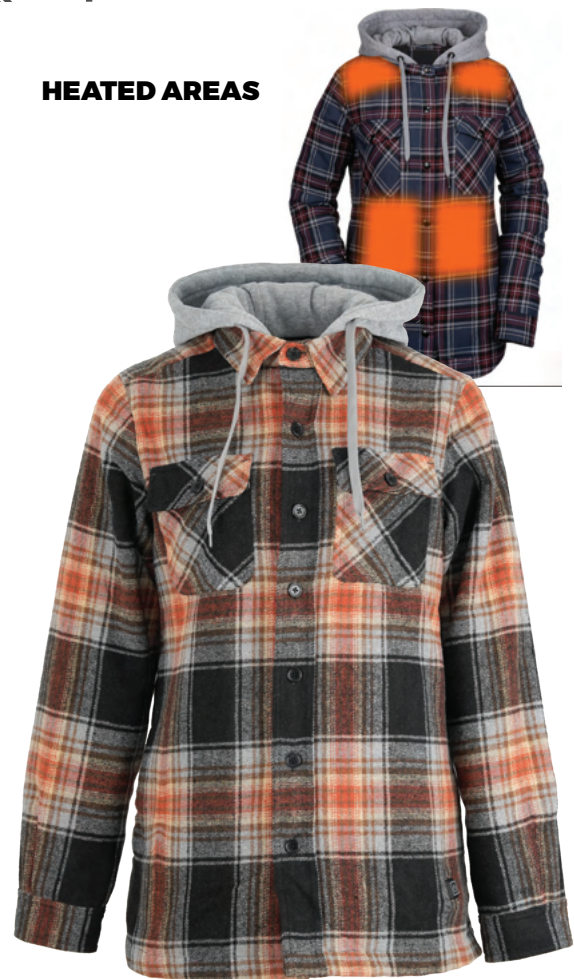
HEATED FLANNEL FLHQ-L-H-PB